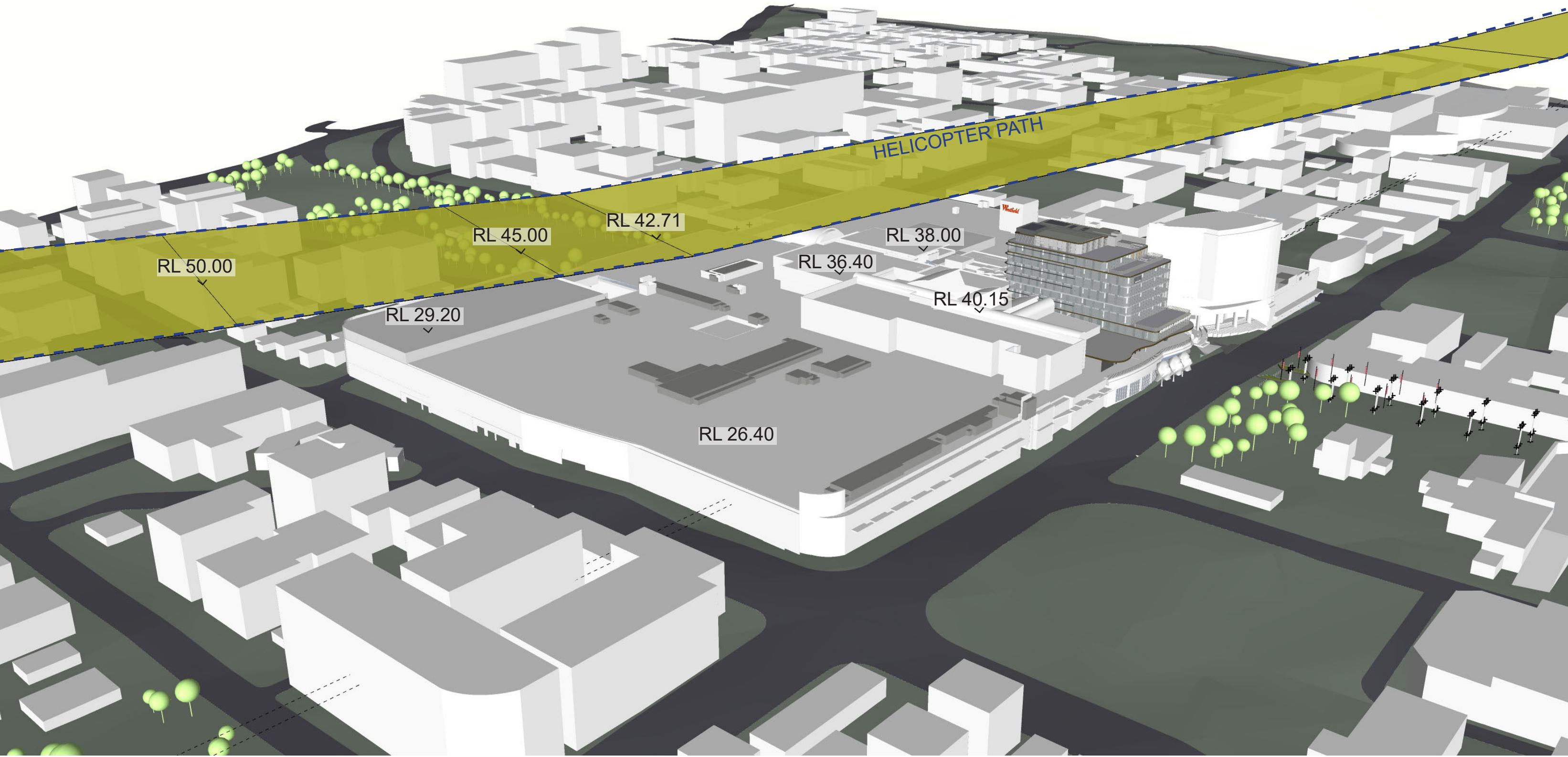
3D VIEW 1 - PROPOSED MASSING LOOKING NE (NTS)

INFORMATION FROM LIVERPOOL LOCAL ENVIRONMENTAL PLAN 2008 (SHEETS KYS 011)